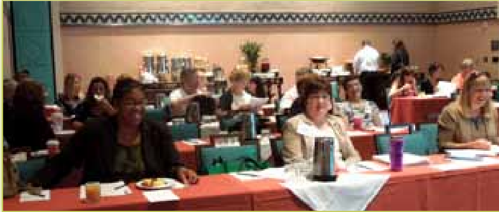
Participants at a CAHIIM Initial Accreditation Workshop July 2012 – Orlando, Florida

CAHIIM held four initial accreditation workshops this year designed to guide new programs through interpretation of the Accreditation Standards, provide a step-by-step guide to the program self-assessment process using the web-based CAHIIM Accreditation