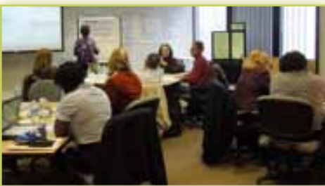
CAHIIM Board of Directors engaged in Strategic Planning in Chicago

Make sure to look for CAHIIM at the 2013 HIMSS conference in New Orleans, LA, March 3-7, 2013 – booth #5 in University Row.