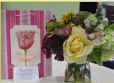
Artificial flower arrangement courtesy of Liliefleur© floral designs.

CAHIIM exhibited at the AHIMA National Convention held in Chicago, IL in October 2012.